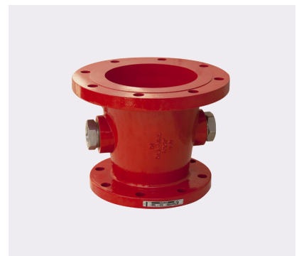
Fire Pump Waste Cone