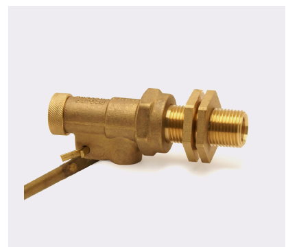
Bronze Float Valve