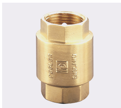
Spring Check Valve