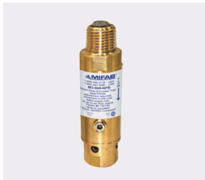
Trap Seal Primer