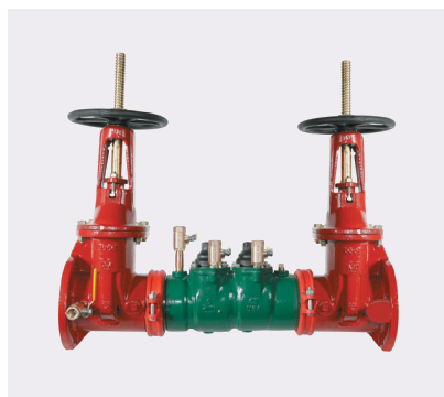
Backflow Prevention Valves