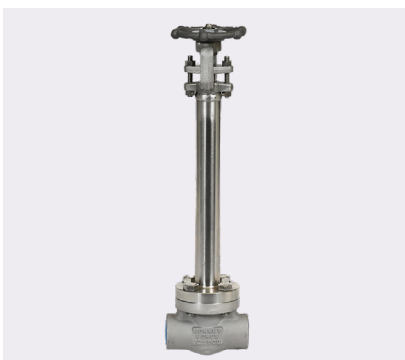
Forged Steel Cryogenic Valve