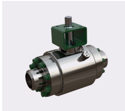
Compact Ball Valve