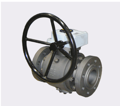
Forged Trunnion Ball Valve