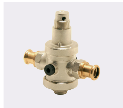
Pressure Reducing Valves