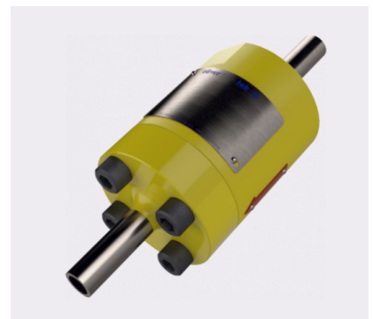
Subsea Check Valve