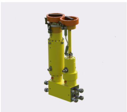
Subsea Gate Valve