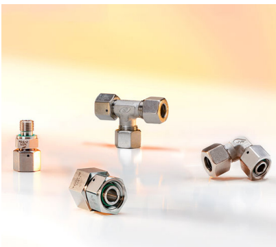
Cone Sealing Couplings