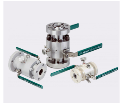
Floating Ball Valve