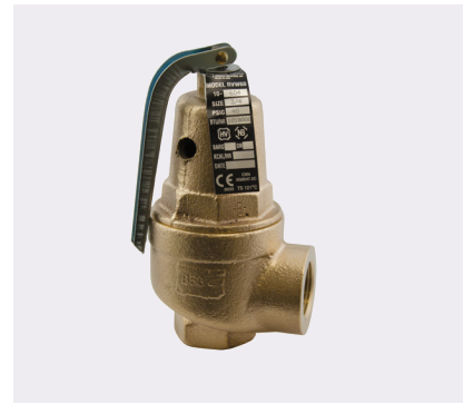
Pressure Relief Valves