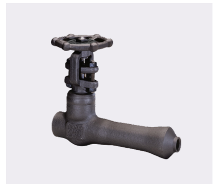
Extended Body Gate Valve