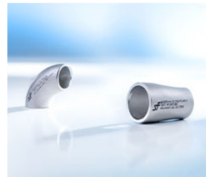
Butt Weld Fittings