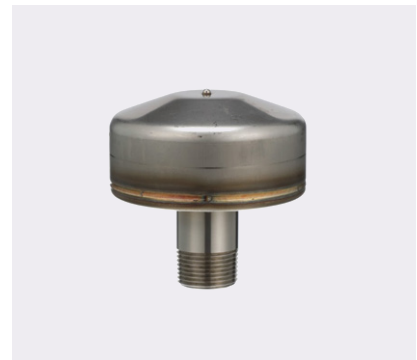
Water Hammer Arrestor