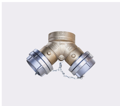
Firefighting Connection Valve