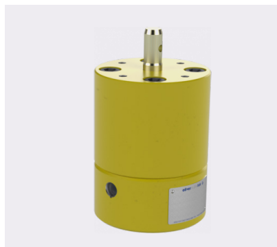
Subsea Needle Valve