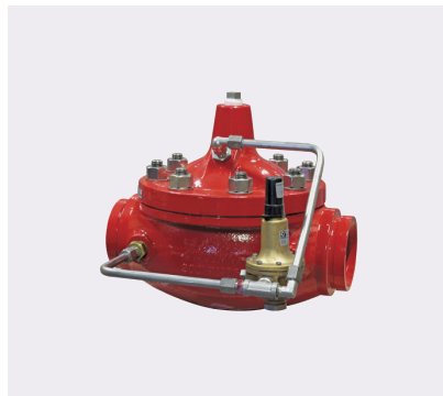
Pressure Reducing Valves