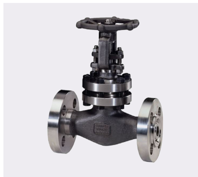
Integral Flanged Valves