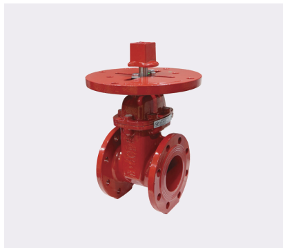
NRS Non-rising Valve