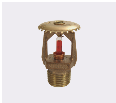
Standard Response Sprinkler