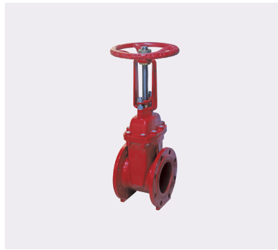
OS&Y Gate Valves