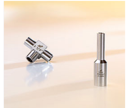
Orbital Weld Fittings