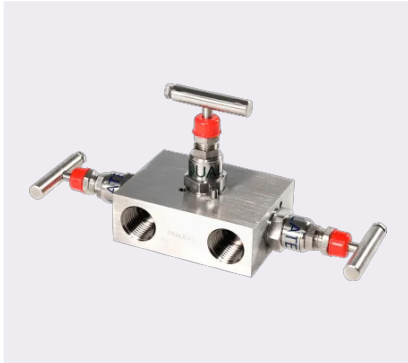
Needle Valve Manifold

Oliver Valves specialize in instruments, pipeline and subsea applications, providing high-integrity, corrosion-resistant valve solutions engineered to withstand harsh environments while ensuring secure, efficient fluid control operations.