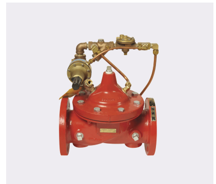
Pressure Relief Valves