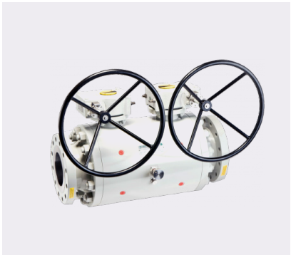
Trunnion Ball Valve