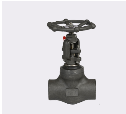
Cast Steel Globe Valves