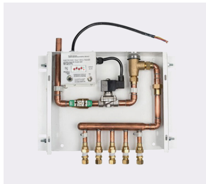
Electronic Trap Seal Primer