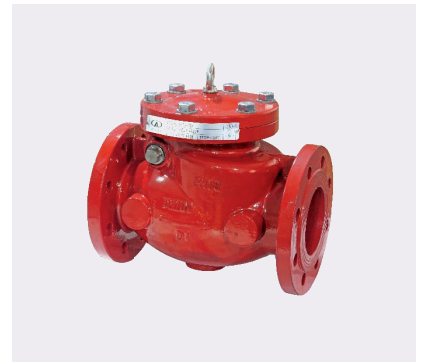
Swing Check Valves