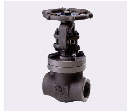
Cast Steel Gate Valves