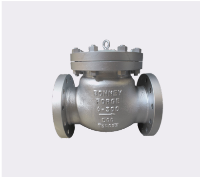
Cast Steel Check Valves

Bonney Forge supplies high-quality forged and cast steel products including valves, fittings, unions, and specialty items, engineered to exacting standards with comprehensive quality assurance and technical support systems globally.